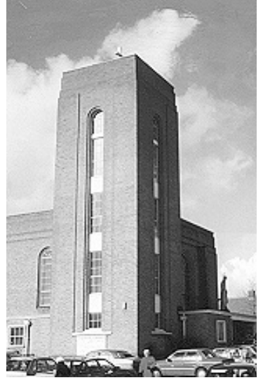
OUR LADY, QUEEN OF APOSTLES